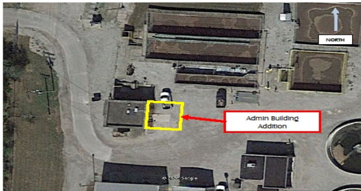
Exhibit No. 4 – Admin Building Site Map